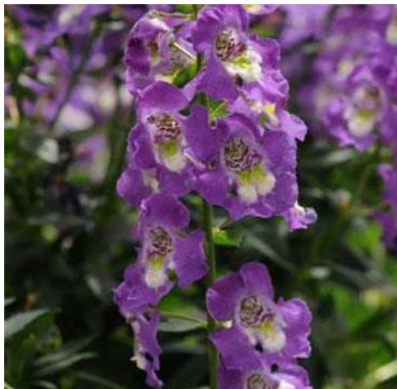
Angelonia 'Archangel Purple'

The angelonia is probably the lowest-maintenance plant I've ever grown. Cultivars have been on the market for several years now and they just seem to sit where they're planted and bloom their little heads off, all the way until frost. Little-to-no-deadheading. Occasional watering. Just forget about them and let them do their thing, which is bloom.